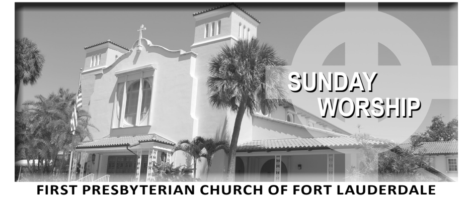
FIRST PRESBYTERIAN CHURCH OF FORT LAUDERDALE