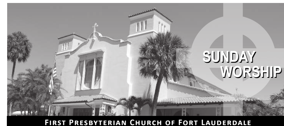
FIRST PRESBYTERIAN CHURCH OF FORT LAUDERDALE