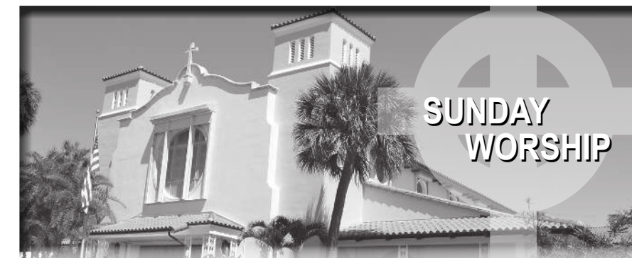
FIRST PRESBYTERIAN CHURCH OF FORT LAUDERDALE