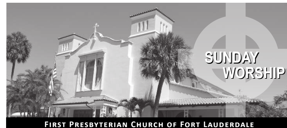
FIRST PRESBYTERIAN CHURCH OF FORT LAUDERDALE